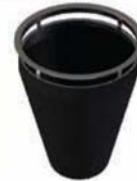
Replaceable Sediment Bag

Lift Handles ease installation and maintenance